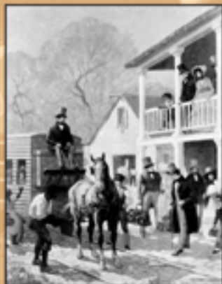
The box-shaped horse-drawn rail car at Relay.

The routes chosen for railroads often followed the course of rivers, providing a scenic and delightful view for passengers. However, scenery had nothing to do with the choice of routes. River valleys cut through mountains and provided railroads easy grades that were close to sea level. The more level the railroad grade, the lower fuel consumption and the faster the trip, which helped the railroad to show a higher profit.