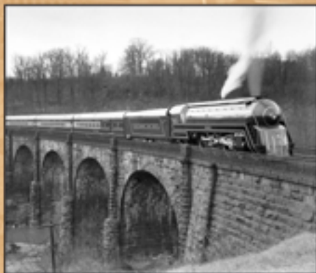
The B&O's Royal Blue on time en route to Baltimore.

The Thomas Viaduct, a multiple-arch stone bridge, curves across the Patapsco River in a graceful four degree arc. Started on July 4, 1832, it was dedicated July 4, 1835. It cost $142,236. Nicknamed "Latrobe's Folly," it was expected to dramatically collapse in a cloud of dust as the first train rolled across. Architect Benjamin H. Latrobe planned for the 612 foot, eight-arched bridge to stand through time like the pyramids of Egypt. Latrobe was right and the skeptics were wrong. Today, in testimony to his genius, all the interlocked granite blocks remain in place. The Thomas Viaduct, a survivor of disastrous floods, stands majestically today as a National Historic Landmark and the icon of the Patapsco River Valley.