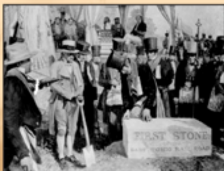
On July 4, 1828, Charles Carroll of Carrollton, the last surviving signer of the Declaration of Independence, dug the first spade of dirt to start construction of the B&O railroad.

In the summer of 1830, the Tom Thumb, most famous of the early locomotives, was on a trial run when it was challenged to a race by a horse-drawn passenger car. The Tom Thumb held the lead until the band which drove the pulley that drove the blower snapped from the drum, causing the steam engine to lose power and the horse won the race. Soon afterwards, the steam engine was improved. By summer of 1831, the Iron Horse was pulling the train to Ellicott's Mills on a regular schedule, and the horse went out to pasture.